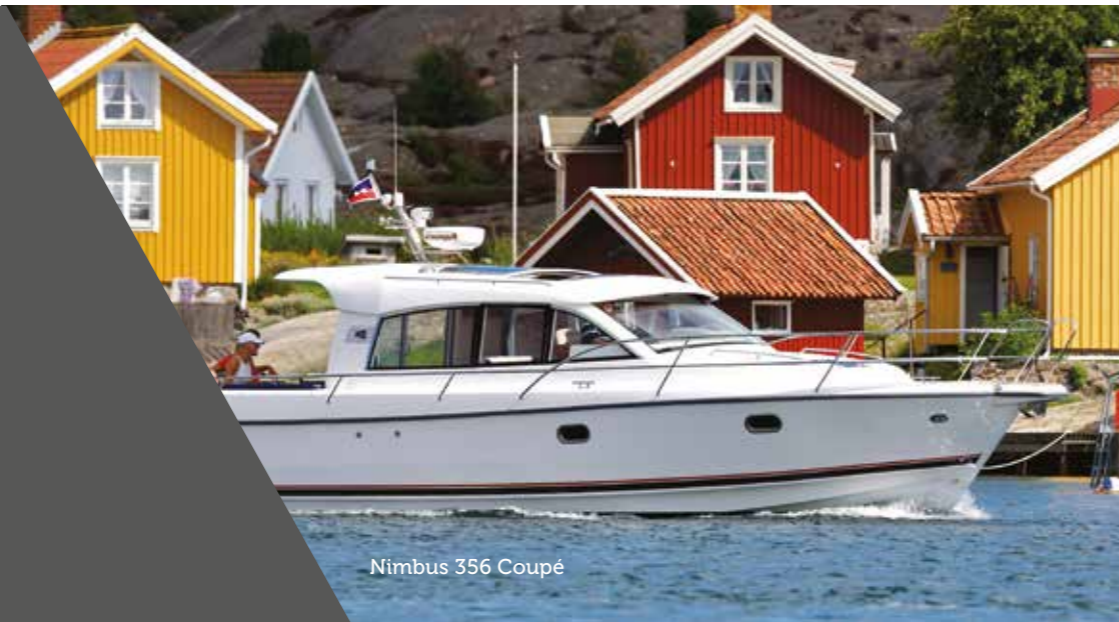
Nimbus 356 Coupé